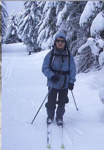
Kids of all ages, skiers and showshoers alike, enjoy the miles and miles of groomed trails!